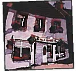
Doris French (venue 21)