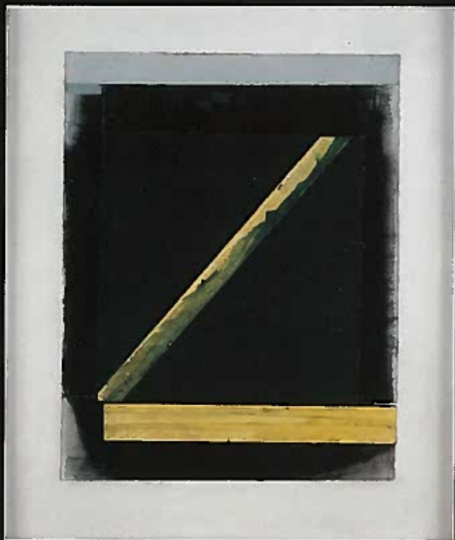
Diagonal with Base Philip Reeves RSA FRSA RCI RE