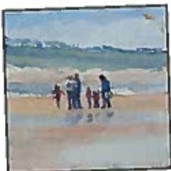
Pot Holland (venue 78)