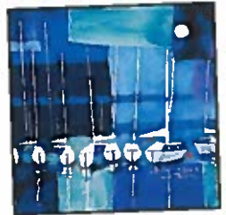
Shiela Tocher (venue 62)