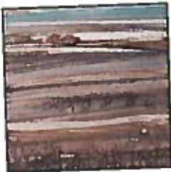
Isabella Colville (venue 61)