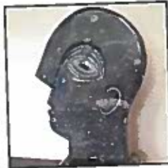
Tom Allan (venue 30)