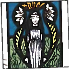
Artisan Glass (venue 82)